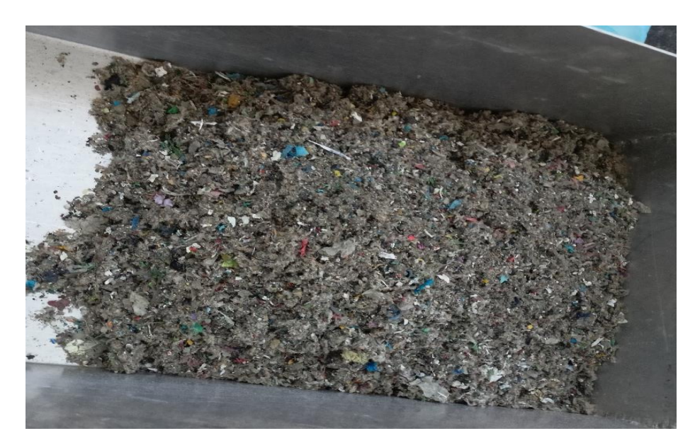
Fig. 1 Ground recycled iRDF waste prepared for its mixing with wood particles and adhesive mixture for the particleboard production.

iRDF is created by high-speed grinding of common municipal waste as a by-product. Recyclable and inert components are first sorted out of municipal waste, e.g. metals, mineral components, bio-components suitable for composting, some types of plastic, cardboard, etc. The remaining component mainly contains non-recyclable plastics (up to 70%), paper, wood, textile materials and usually ends up as energy raw material for cement plants and waste incinerators or, in the worst case, only ends up in a landfill, as there are few capacities for ecological waste incineration (Fig. 1) (Internal unpublished company's materials 2023).