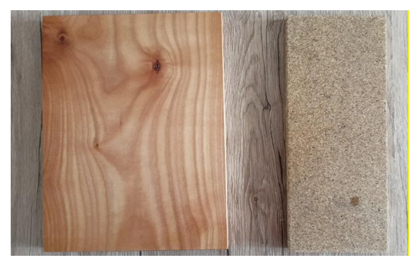
Fig. 5 Modified three-layer particleboard with the presence of 15% iRDF in the core layer surface treated with veneering for demonstration purposes (left) and raw particleboard with the presence of 15% iRDF in the middle layer without surface treatment (right).

The surface of one pressed modified three-layer particleboard with veneering was upgraded for demonstration purposes. Its appearance (Fig. 5 left) was excellent, the presence of iRDF in its structure is understandably invisible. The presence of iRDF in the core layer of the three-layer particleboard was not visible even in the surface layers of raw particleboard without surface treatment (Fig. 5 right).