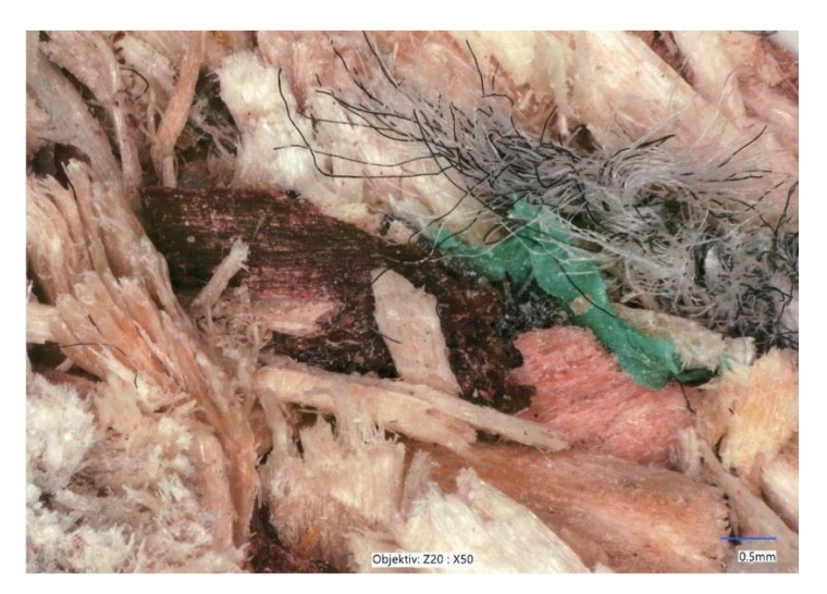
Fig. 3 Microscopic structure of the core layer of modified particleboard with the presence of recycled iRDF waste.

These findings are also consistent with the results of the work of Baharuddin et al. , (2023).