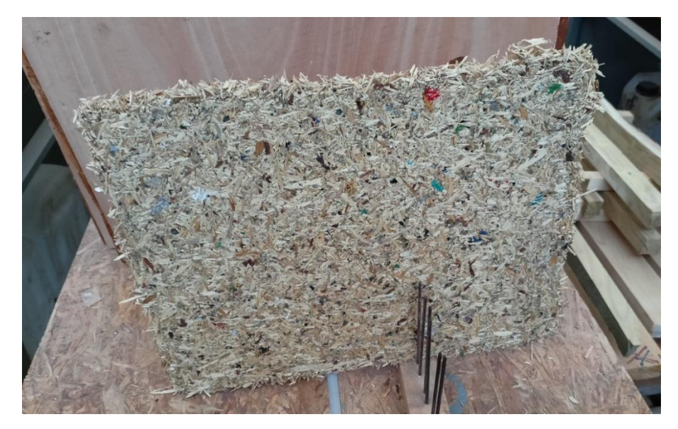
Fig. 4 Recycled iRDF together with wood particles present on the surface of pressed single-layer particleboard.

The surface of one pressed modified three-layer particleboard with veneering was upgraded for demonstration purposes. Its appearance (Fig. 5 left) was excellent, the presence of iRDF in its structure is understandably invisible. The presence of iRDF in the core layer of the three-layer particleboard was not visible even in the surface layers of raw particleboard without surface treatment (Fig. 5 right).