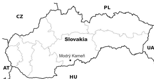
Fig. 1 Location of studied area Modrý Kameň.

Sweet chestnut trees are grown here in orchards and also in forests. They are predominantly spread in a hilly country, on the slopes with eastern and western exposure and the elevation of 250–500 m a. s. l. The estimated number of trees growing at this locality is 1500–2000 (BENČAĽ 1960).